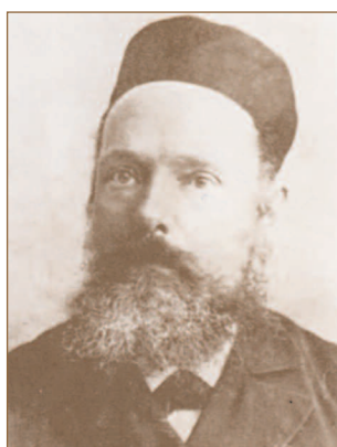
Yehiel Michael Pines