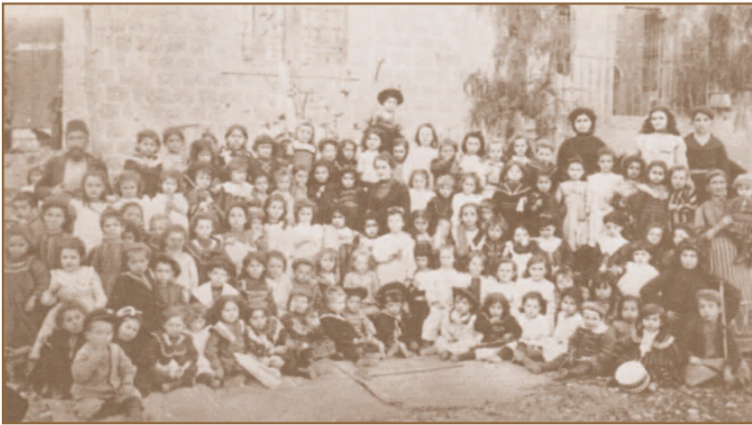
First Hebrew Kindergarten.

Subsequently B’nai B’rith opened a seminary for kindergarten teachers in Jerusalem, and the lodges in Jaffa, Safed, Tiberias, Rehovot, Haifa, and Beirut followed the Jerusalem example and opened Hebrew-speaking kindergartens. As the language wars were being fought on the university level—Hebrew vs. German as the language of instruction at the Technion in Haifa—the battle for Hebrew was being won with the new generation as scores of youngsters learned to speak what was destined to become the national tongue.