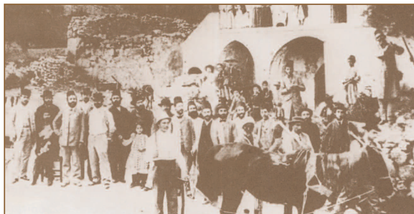
Motza, 1895—First Jewish building, David Yellin standing third from left.