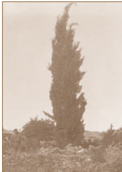
Herzl’s cypress tree, before it was felled.