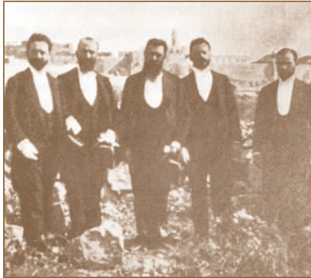
Theodor Herzl (center) with Zionist leaders on his visit to Holy Land—opposite Jerusalem’s Old City Walls—1898.