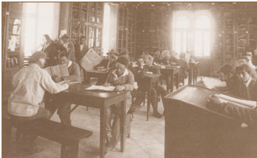
B'nai B'rith Library-1925.