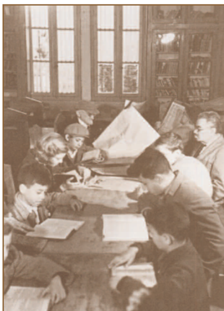
B'nai B'rith Library, new immigrants-1948.