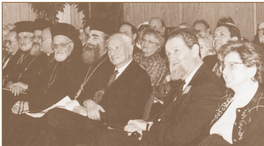
International Conference on Religion and Politics—November 1997.

tion that would directly link B'nai B'rith headquarters in Washington and B'nai B'rith districts around the world with the realities, challenges, and promises of Israel. This was the background upon which the World Center was established.