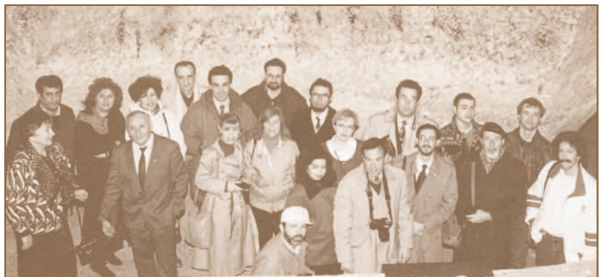
Participants in World Center Leadership Seminar—1994.