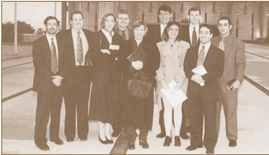
Congressional Staff Mission—January 1998.

programming prerogatives. These include B'nai B'rith Uruguay, the Center for Public Policy, B'nai B'rith Chile, B'nai B'rith Canada, B'nai B'rith Europe, B'nai B'rith England, the B'nai B'rith Klutznick National Jewish Museum, the B'nai B'rith Center for Community Action, and the B'nai B'rith Center for Jewish Identity. Most recently, the World Center and the Center for Public Policy conducted a mission to Israel for U.S. congressional staffers.