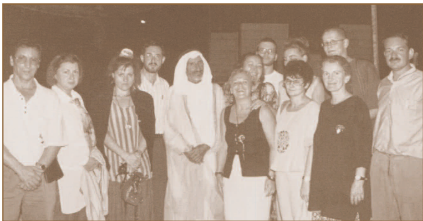
Tolerance and Pluralism mission—conducted with UNESCO funding.