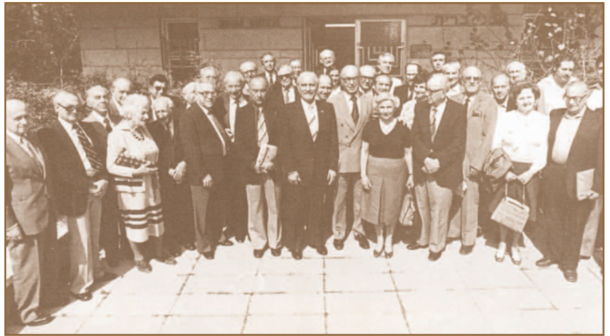
Meeting of the B'nai B'rith World Center Board of Trustees—Jerusalem, 1982.

leadership of B'nai B'rith, and among Israeli government officials as well, that this new challenge to Jewish sovereignty over Jerusalem called for an extraordinary response—the establishment of an institu-