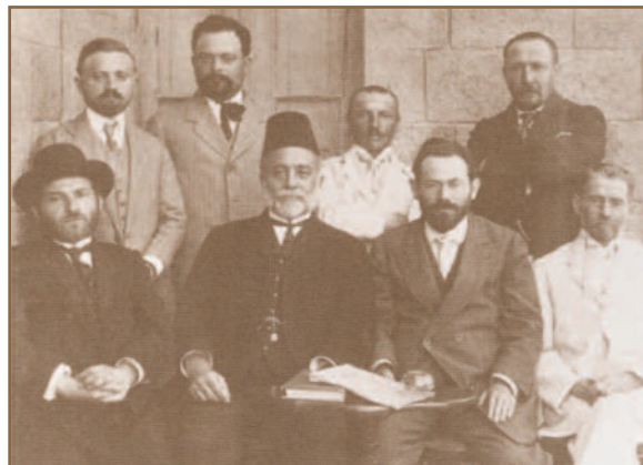
Hebrew Language Committee, sitting from left: Eliezer Ben-Yehuda, Prof. Joseph Klausner, David Yellin.

Beyond the ideal of making Hebrew common to all Jews, the Jerusalem Lodge had a practical reason to support the widespread use of Hebrew. True to the egalitarian and pluralistic principles of B’nai B’rith, the Jerusalem Lodge was the only institution at the time which opened its doors to all ethnic groups and from its inception set out to meld the fragmented Jewish sects into a sin-