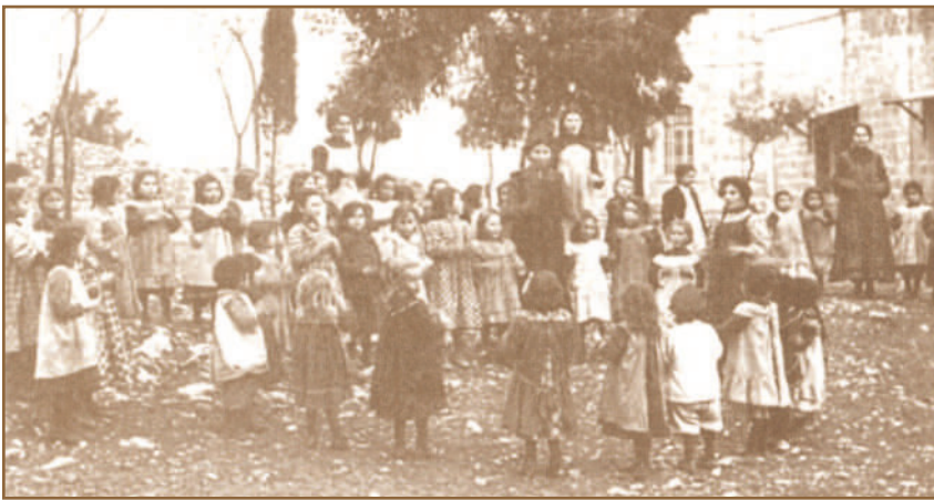
Second Hebrew Kindergarten-1907.