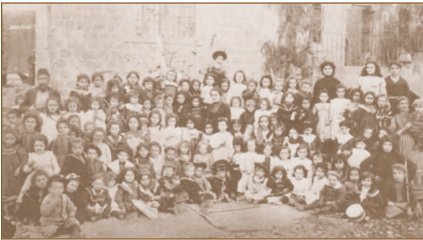
First Hebrew Kindergarten.

Subsequently B’nai B’rith opened a seminary for kindergarten teachers in Jerusalem, and the lodges in Jaffa, Safed, Tiberias, Rehovot, Haifa, and Beirut followed the Jerusalem example and opened Hebrew-speaking kindergartens. As the language wars were being fought on the university level—Hebrew vs. German as the language of instruction at the Technion in Haifa—the battle for Hebrew was being won with the new generation as scores of youngsters learned to speak what was destined to become the national tongue.