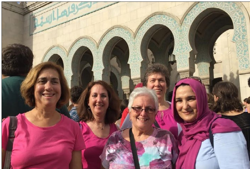
Sisterhood members on a visit to Washington, D.C.'s Islamic Mosque and Cultural Center.