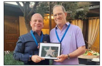
Recap of the 2018 Confer- ence on Senior Housing Page 10