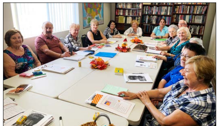
Golden Years Apartments residents participating in the weekly English as a Second Language class during the 2018 Housing Conference tour of the building in North Hollywood, California.

Particularly noteworthy is the weekly English as a Second Language class, taught by a fellow resident. This has been an invaluable benefit to many residents looking to improve their English. Participants practice diligently