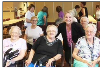
Congressional Candidates Visit Residents Page 6