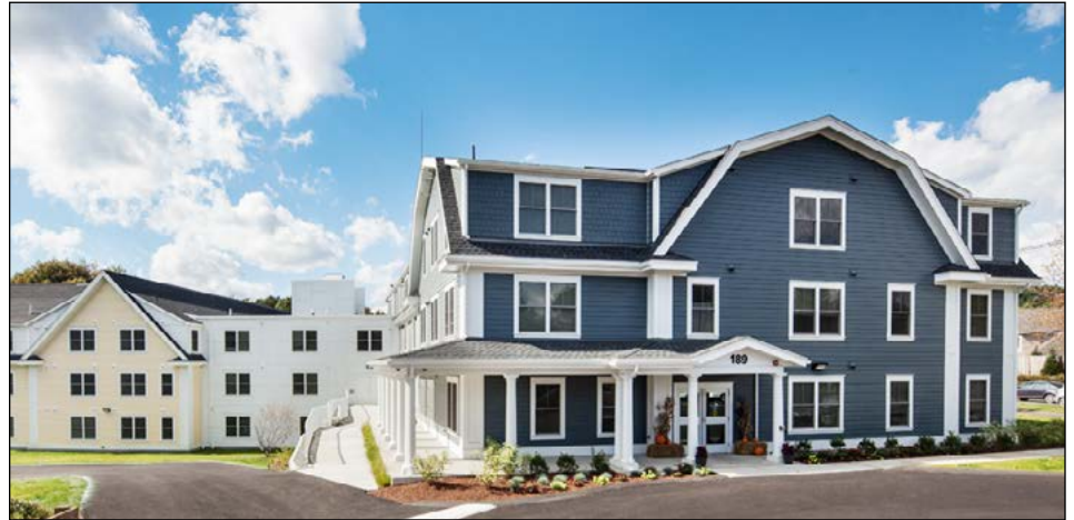
TOP: The Coolidge at Sudbury Apartments, a building comprised of 65 units, located in Sudbury, Massachusetts, a suburb of Boston. The property used tax credit financing as the major funding source for their development. RIGHT: Recently renovated apartment at the Adelstein Family B'nai B'rith Project H.O.P.E. apartments in the Bronx, New York.

Additionally, we are pleased to report that this past April, B'nai B'rith Senior Housing closed on a major refinancing proposal to renovate and modernize the Adelstein Family B'nai B'rith Project H.O.P.E. property in the Bronx, New York. The building was constructed in 1992 under the federal government's Supportive Housing for the Elderly program. It consists of 100 residential apartments, 25 of them studios, and one unit for a live-in building superintendent. Rent for each