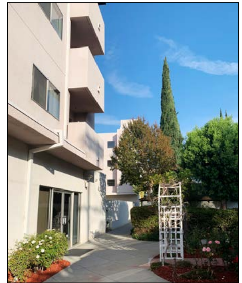
A glimpse of the beautiful landscape surrounding the Golden Years Apartments building in North Hollywood, California.