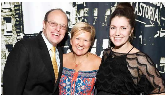
The Center for Senior Services team pose for a photo during an evening gala, celebrating B'nai B'rith International's 175th anniversary during the B'nai B'rith 2018 Leadership Forum in New York City.

The 2018 B'nai B'rith Conference on Senior Housing was held in North Hollywood, California in late October. See the recap of the conference on page 10 .