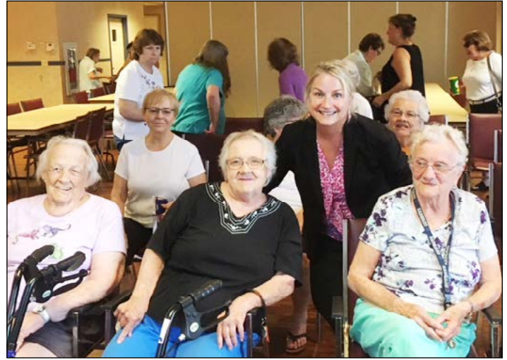
Democratic candidate for Pennsylvania's 7th congressional district, Congresswoman-elect Susan Wild, poses for a photo with residents while on a tour of B'nai B'rith Apartments of Allentown, Pennsylvania during the lead up to the 2018 midterm elections.

One of the hallmarks of B'nai B'rith's advocacy efforts is inviting members of Congress and their staff to tour our sponsored senior housing buildings across the country. Always looking to build on our accomplishments, and because it was election season, we started inviting congressional candidates to tour B'nai B'rith facilities to highlight the importance of Section 202 housing. The Center for Senior Services team is proud to report that Republican candidate Marty Nothstein and Democratic candidate Congresswoman-elect Susan Wild, both running in Pennsylvania's 7th congressional district, toured B'nai B'rith Apartments in Allentown, Pennsylvania to meet with residents and discuss the critical importance of housing for adults with limited means. Nothstein visited the complex on Aug. 16 and Wild toured the building on Sept. 5.