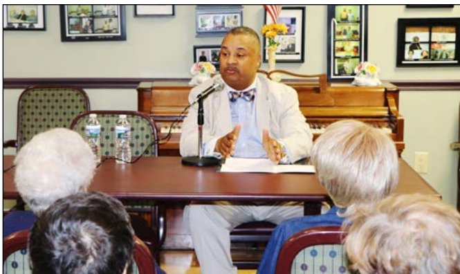
Rep. Donald Payne, Jr. (D-New Jersey) leads a Q&A session with residents at the South Orange B'nai B'rith Federation House in South Orange, New Jersey.