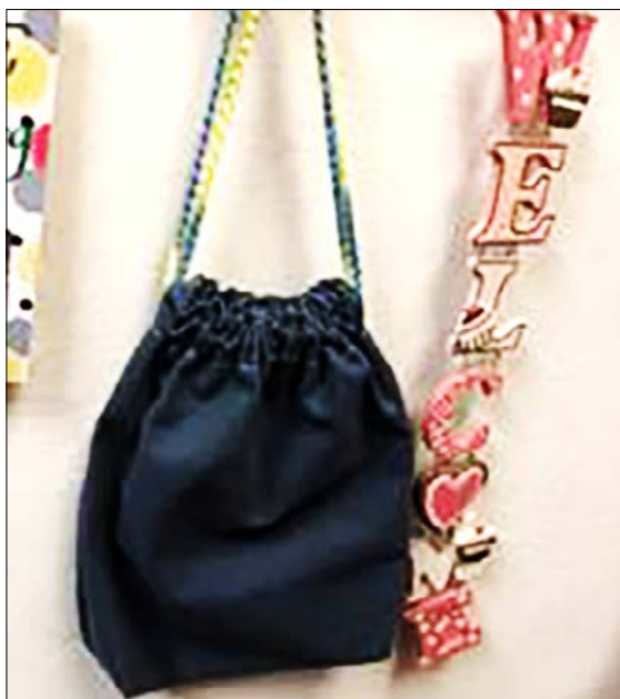
A hand-made tote bag sewn and donated for children in foster care in the Tucson region.