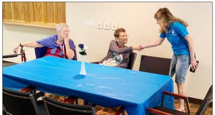
Residents and a B'nai B'rith Connect member introduce themselves at the Intergenerational Breakfast "meet and greet."

In early February, over 25 "next generation leaders" ages 20-40 from all across the country joined together in Fort Lauderdale, Florida, to unite and build for the future of B'nai B'rith. In addition to holding a leadership retreat packed full of meetings and guest speakers, they celebrated Shabbat with a sommelier, held a beach brunch party and watched the Super Bowl from a rooftop. However, their weekend became even more fulfilling when the group of young professionals stopped to serve breakfast to seniors at B'nai B'rith's Deerfield Beach affordable housing complex. This visit was the first time many of our next generation leaders had the opportunity to gain a concrete and hands-on appreciation for B'nai B'rith's senior housing operations. That experience