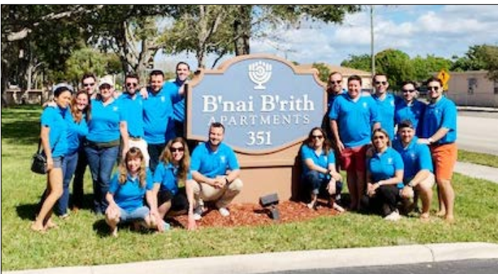
Members of B'nai B'rith Connect pose outside of B'nai B'rith Apartments of Deerfield Beach.