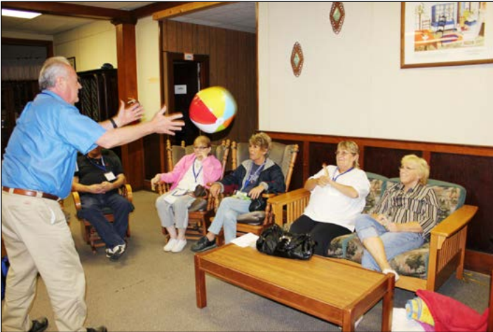
Resident leaders get to know each other in this ice-breaker game, in which campers catch the ball and answer a question written on one of the colored segments.