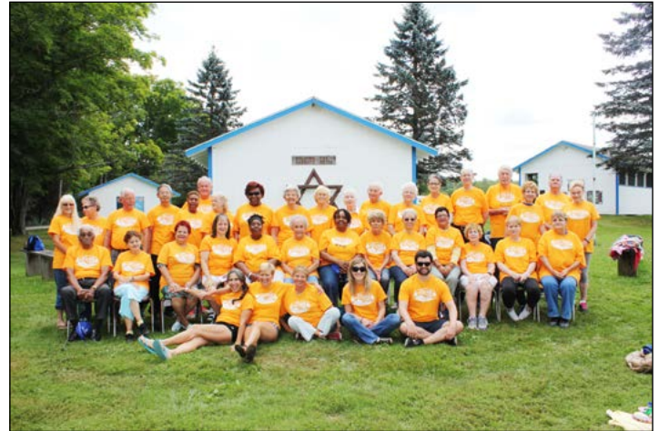
Campers pose for their end of the week group shot. At the end of an intensive week, residents from throughout the US have formed strong relationships with each other.

This year's B'nai B'rith Resident Leadership Retreat will take place from Aug. 7-13, 2019, at Perlman Camp in Pennsylvania. Held every other summer, the retreat brings together two resident leaders from each of the various resident councils/associations currently operating throughout the