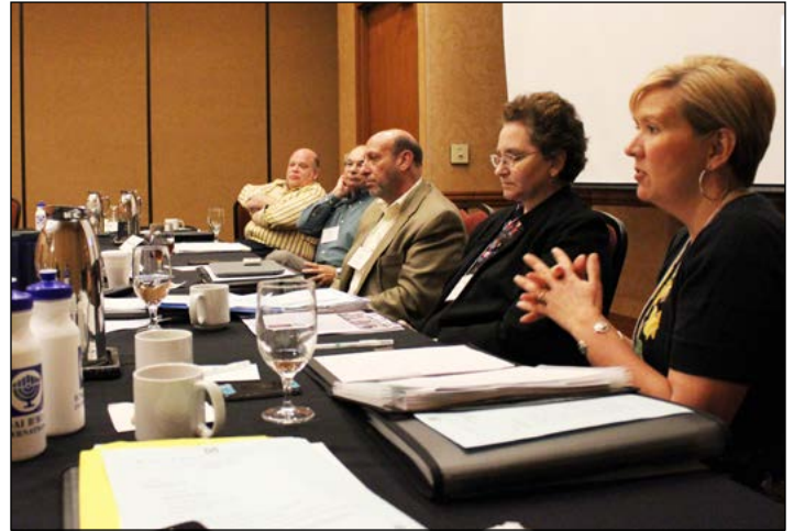
B'nai B'rith Senior Housing Committee meeting (2014)

The Annual B'nai B'rith Conference on Senior Housing was held Oct. 17-19, 2021. Over 70 people attended the three-day meeting. This conference brings together the volunteer boards