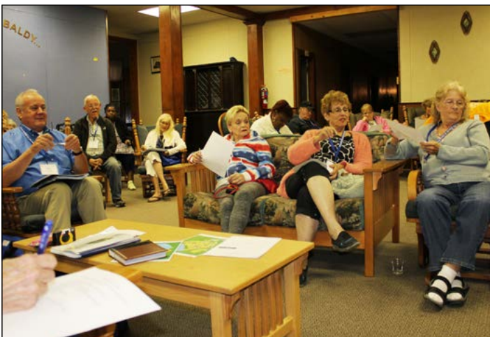
B'nai B'rith Leadership Retreat (2015)