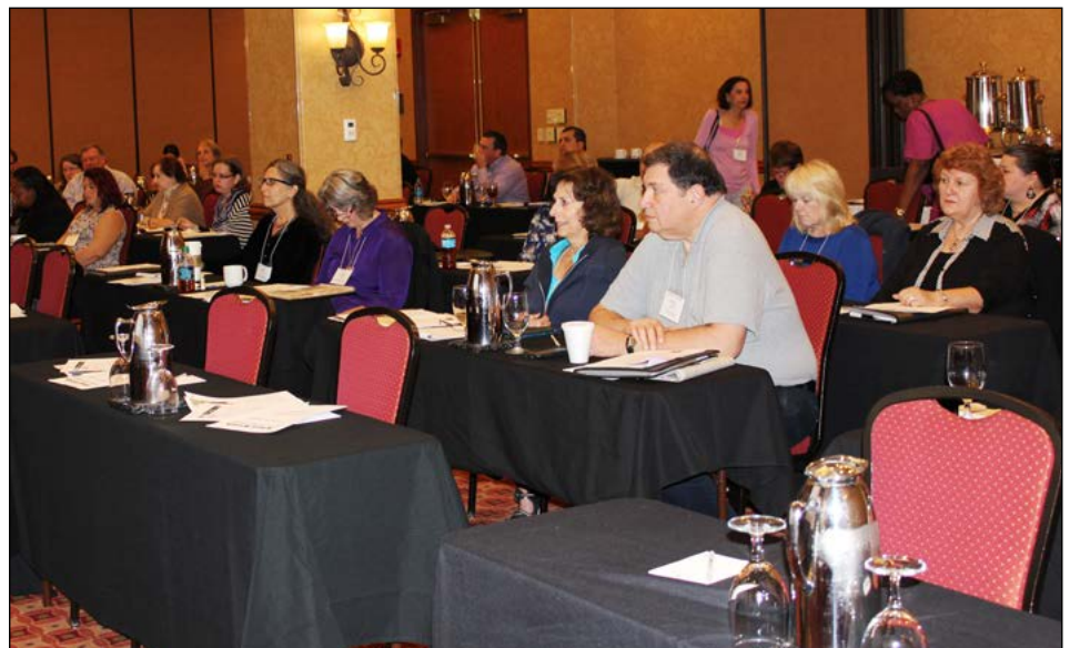
B'nai B'rith Conference on Senior Housing (2014)