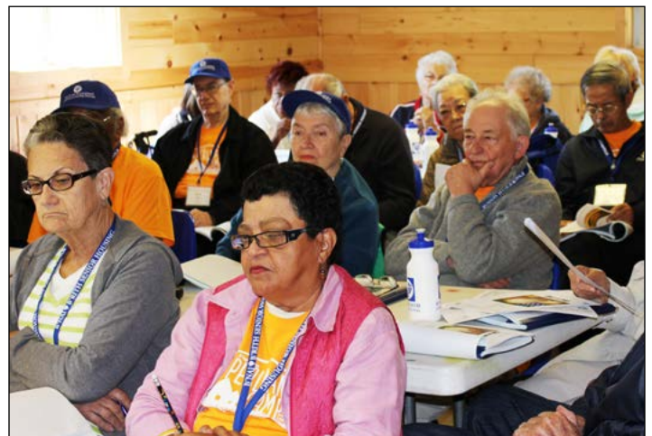
Residents enjoy a camp-like experience at B'nai B'rith Perlman Camp