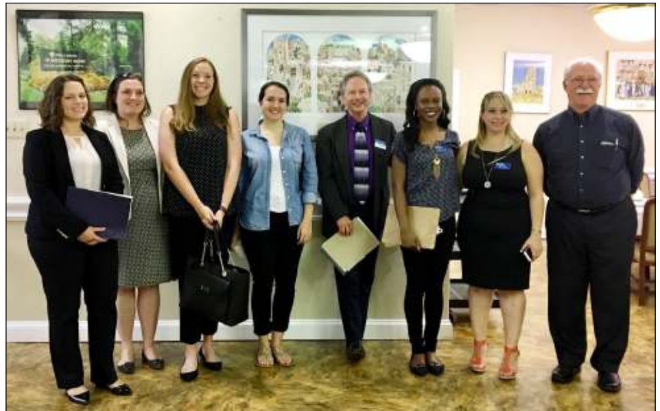
Concluding their tour, on-site staff and vice-president of B'nai B'rith Homecrest House show congressional staffers the dining hall.