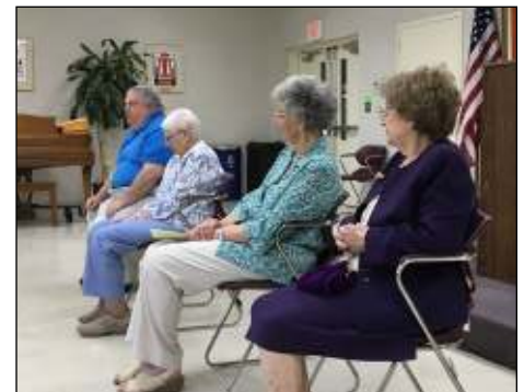
B'nai B'rith Homecrest House residents share their experiences living in a B'nai B'rith building and being a part of the Resident Council with congressional staffers.