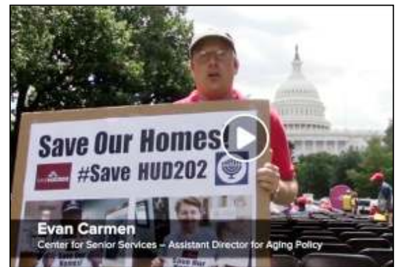
RIGHT: Center for Senior Services staff talk on the importance of the Section 202 program at the Save HUD202 rally. Click the "play" icon above to watch the video.

housing community to express its concern for low-income seniors.