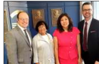
Building Highlight: Queens B'nai B'rith House Page 10