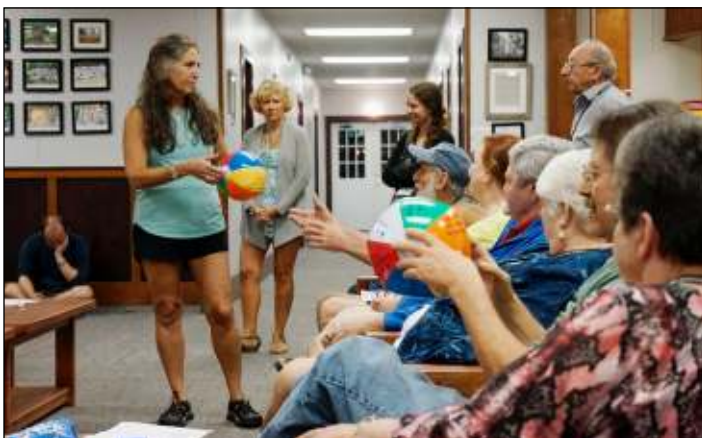
LEFT: Residents participate in a "getting to know each other" evening activity at the Adult Lodge.