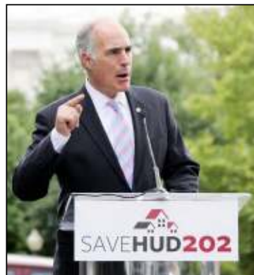
LEFT: Sen. Bob Casey (D-Pa.), ranking member of the U.S. Senate Special Committee on Aging, expresses his support for the Section 202 program at the Save HUD202 Rally.