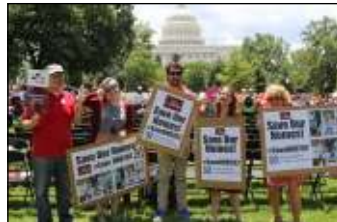
SAVE HUD 202 Rally Page 7