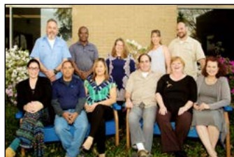
Building Highlight: Goldberg B'nai B'rith Towers Page 4