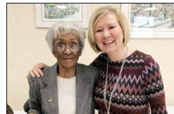
What Has Staff Been Up To? Page 6