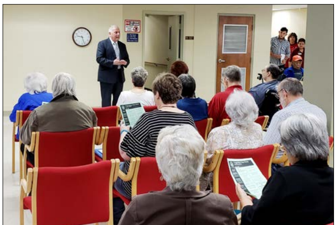
RIGHT: Rep. Gene Green addresses Pasadena Interfaith Manor residents during a Q & A session.