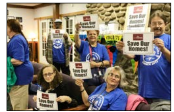
2017 Center for Senior Services Year in Review Page 7