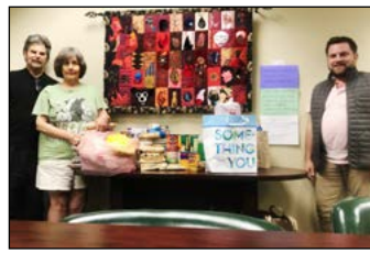
Donated Goods for Victims of Hurricane Maria Page 2