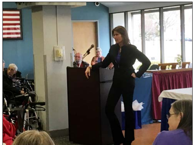
Left photo: Resident of B'nai B'rith Covenant Apartments in Peoria, Illinois asks Rep. Cheri Bustos (D-Ill.) about the security of senior healthcare. Right photo: Rep. Cheri Bustos (D-Ill.) takes questions from B'nai B'rith Covenant Apartments residents.