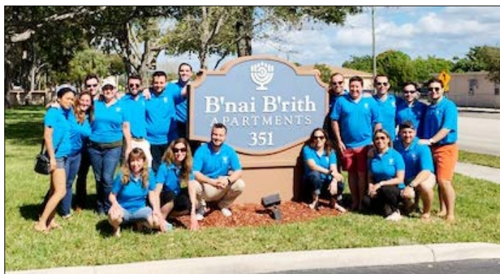
Members of B'nai B'rith Connect pose outside of B'nai B'rith Apartments of Deerfield Beach.