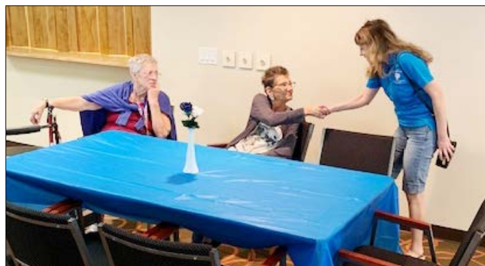
Residents and a B'nai B'rith Connect member introduce themselves at the Intergenerational Breakfast "meet and greet."

In early February, over 25 "next generation leaders" ages 20-40 from all across the country joined together in Fort Lauderdale, Florida, to unite and build for the future of B'nai B'rith. In addition to holding a leadership retreat packed full of meetings and guest speakers, they celebrated Shabbat with a sommelier, held a beach brunch party and watched the Super Bowl from a rooftop. However, their weekend became even more fulfilling when the group of young professionals stopped to serve breakfast to seniors at B'nai B'rith's Deerfield Beach affordable housing complex. This visit was the first time many of our next generation leaders had the opportunity to gain a concrete and hands-on appreciation for B'nai B'rith's senior housing operations. That experience