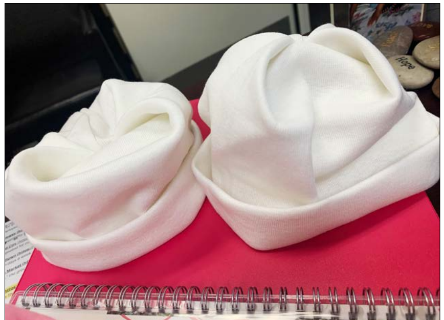
Two baby beanies, sewn by residents at Gerd & Inge Strauss B'nai B'rith Manor on Pantano.