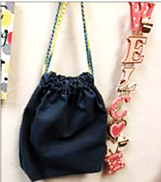
A hand-made tote bag sewn and donated for children in foster care in the Tucson region.