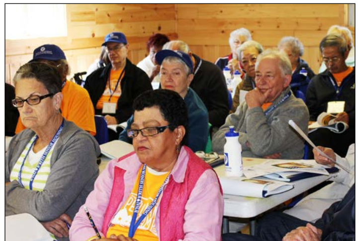
Residents enjoy a camp-like experience at B'nai B'rith Perlman Camp