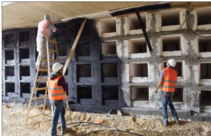
Construction is in progress to build the underground addition to Har Hamenuchot Cemetery, which is a half-mile long and 164 feet deep, the height of a 15-story building.