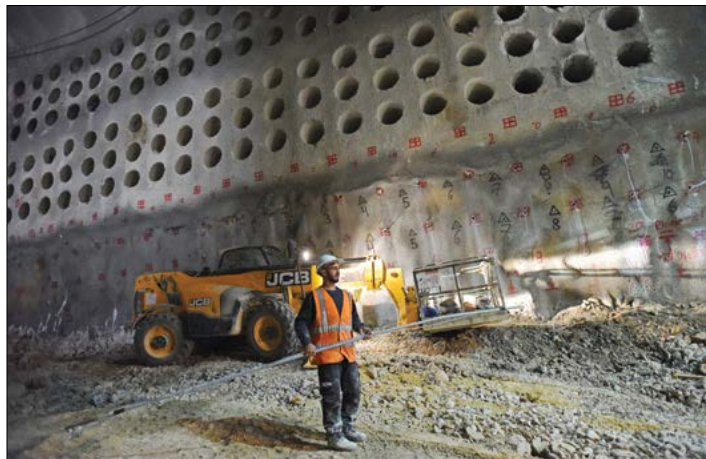
A worker carries material under burial niches in the wall, where bodies will be buried, in the underground cemetery project under construction.