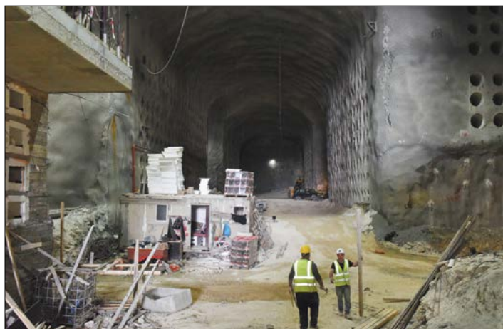
Workers carry materials in the tunnels where the underground cemetery project is being built.