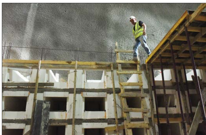
A worker walks on top of precast graves under construction in the cemetery project.