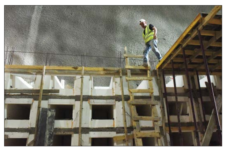
A worker walks on top of precast graves under construction in the cemetery project.