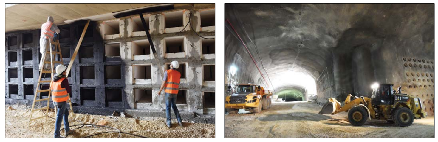
Construction is in progress to build the underground addition to Har Hamenuchot Cemetery, which is a half-mile long and 164 feet deep, the height of a 15-story building.

Har Hamenuchot is "a very big cemetery, but the population of Jerusalem is growing, thank God, and they need more space, and they are already building up vertically," Karzen said, referring to the pre-cast spaces that various burial societies have built there in recent years.