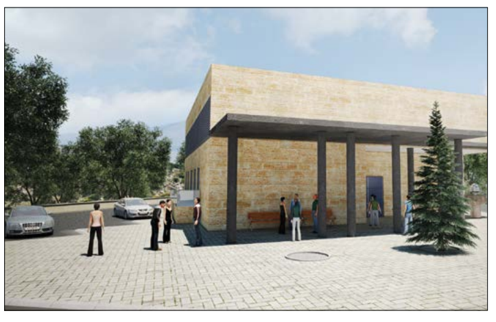
Rendering of a visitor entrance to the underground Har Hamenuchot Cemetery, under construction.