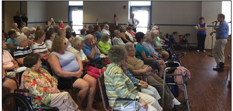
Rep Charlie Dent (R-Pa.) holds a Q&A style town hall at B'nai B'rith Apartments in Allentown, Pa. for a full room of residents.

After the event Dent said, "I truly appreciate the great work B'nai B'rith has been doing here in Allentown, Pa. for decades. B'nai B'rith provides affordable housing options to many