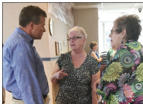
Rep Charlie Dent (R-Pa.) spends time answering questions from residents following the Q&A.