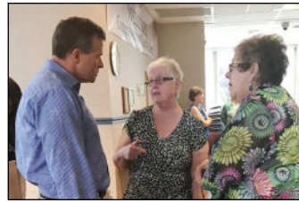
Rep. Charlie Dent Tours B'nai B'rith Apartment Page 6