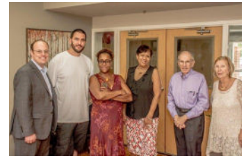
Building Highlight: B'nai B'rith Elmwood House Page 7